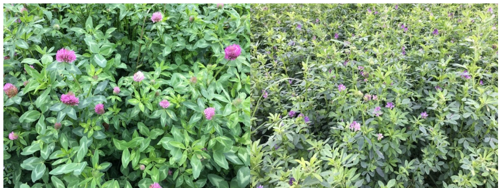
Red clover (left) and lucerne (right).