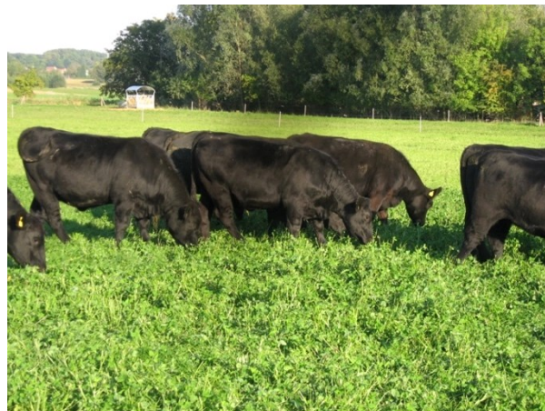
Grazing red clover/cocksfoot mixture