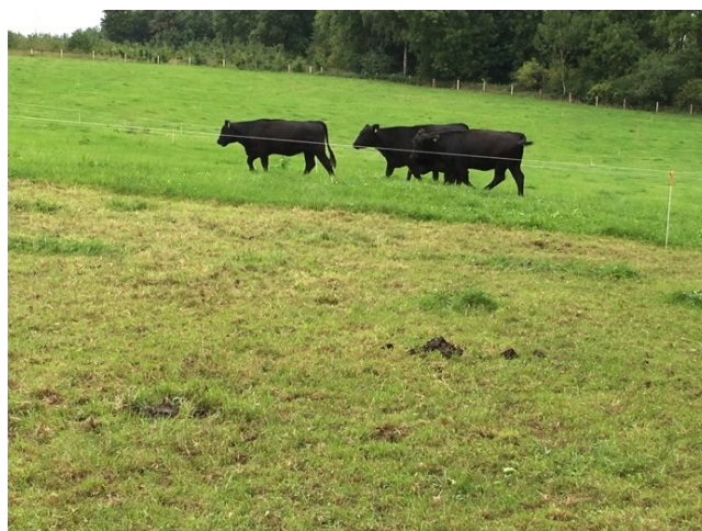
Rotational stocking with electric wire.