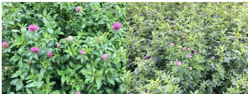
Red clover (left) and lucerne (right).

Producing more grass-based milk and meat on mixed farms, combining arable crops and livestock farming, requires a combination of the following measures: a good grass-land management, a complementarity between permanent grasslands and temporary grasslands, and an animal breed able to effectively transform grass into milk and meat.