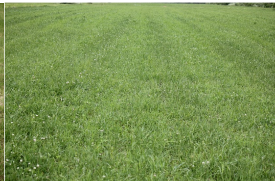
Grassland after aeration

Aeration ensures the insertion of air to the sod layer, which has a positive effect on the vegetation of the valuable meadow plants. It causes also a better use of nutrients from applied fertilizers and prevents the sward from the degradation process. As a result, it is possible to produce larger amounts of grass-based feeds for dairy cows, improve the botanical composition of the sward and increase the efficiency of fertilizer application, especially after the renovation of the meadows.