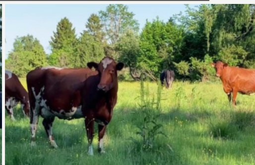
Photo credit: photos generated from farmer interview - Svenska Vallföreningen